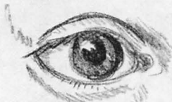
CREE'S EYE (RIGHT)