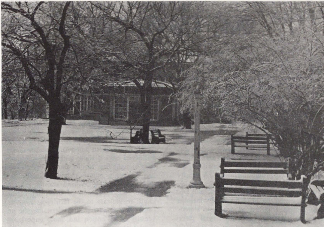
Snow was a comparatively rare sight on campus and winter lovers will have even longer to wait now that signs of spring are becoming more and more evident.