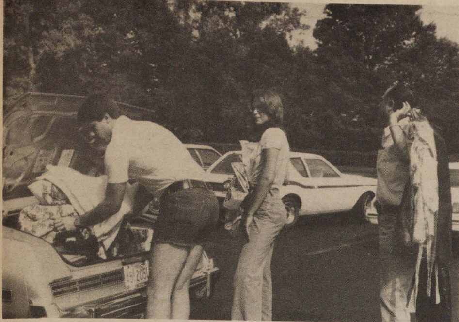
UPPERCLASSMEN HELP FRESHMEN MOVE IN