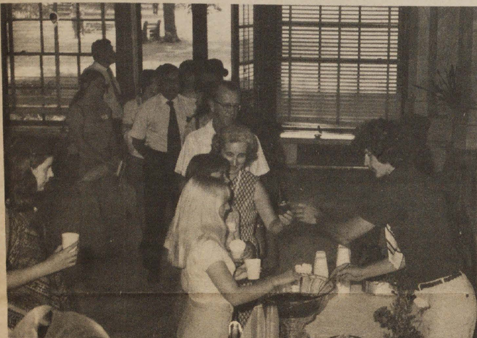
RECEPTION FOR NEW STUDENTS, PARENTS