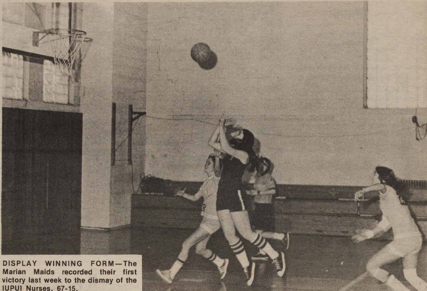
DISPLAY WINNING FORM —The Marian Maids recorded their first victory last week to the dismay of the IUPUI Nurses, 67-15.

Thank you scorers, timers and fans! Hope to see you on the 21st.