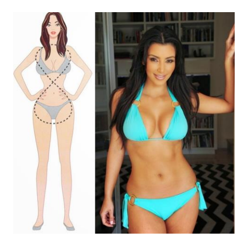
1B (Menezes, 2015)