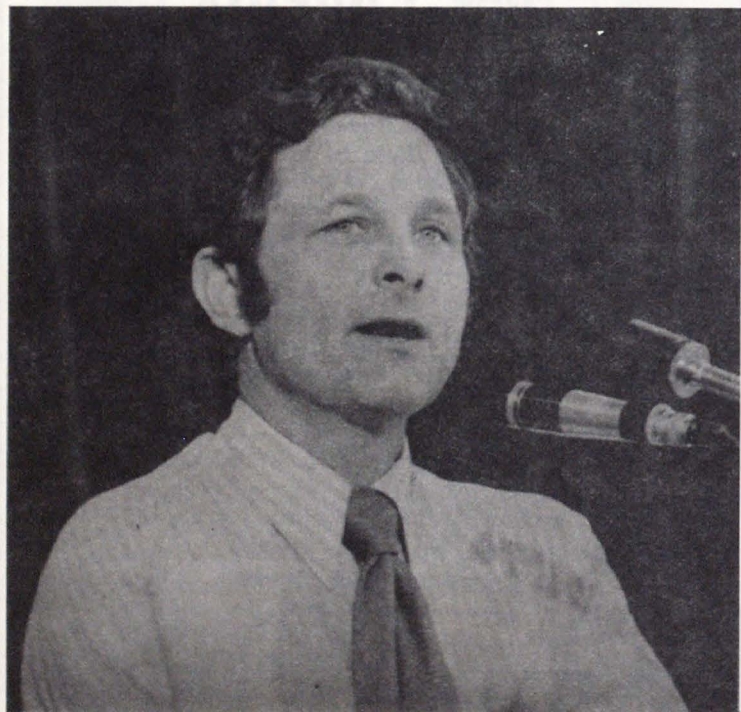
U.S. Senator Birch Bayh was on campus yesterday morning. The senator gave his views on amnesty, welfare, the Supreme Court, etc. in a one hour session wherein the senator "rambled" and answered questions from students and faculty members.