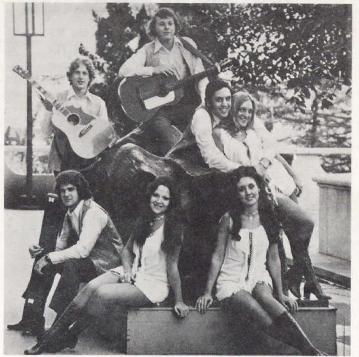
The world famous Serendipity Singers