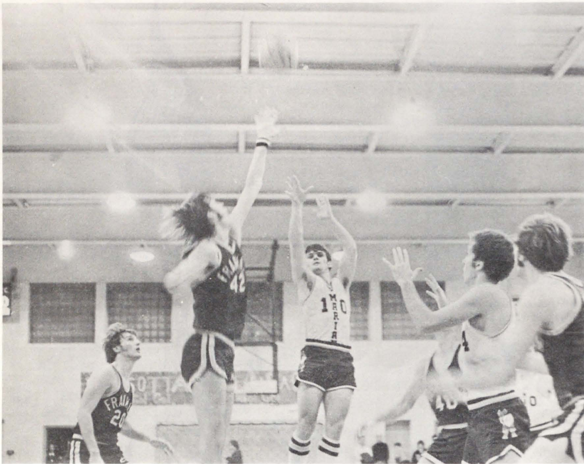
Opposing Franklin player has the edge in a jump ball battle

Forced to fight from behind with all they had, the Marian College Knights literally "stole" the game from arch rival Franklin last Tuesday and took home a well deserved 82-80 victory.