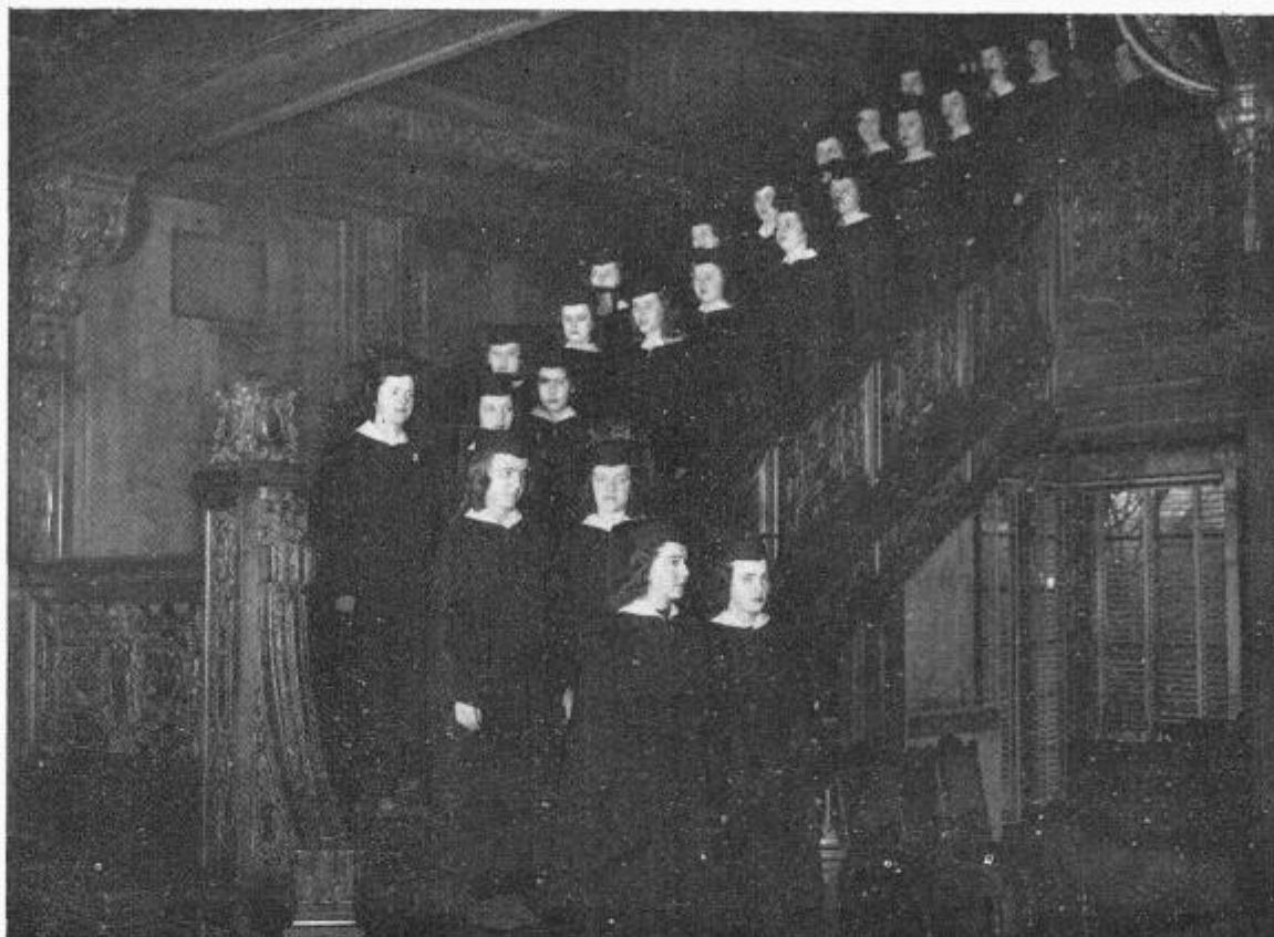
Processional —Students in academic costume take places to lead the formal commencement procession down the carved walnut stairway and through the reception room to the main entrance. Keeping step with Elgar's "Processional" played on the organ, they will escort the graduates and those officiating at the exercises to Madonna Hall.