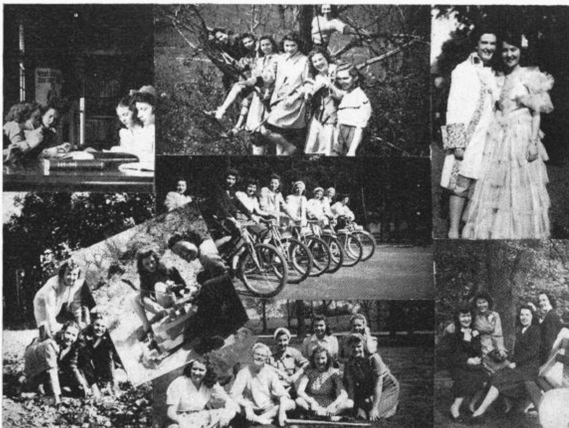
Upper left: library study. Lower left: woodland calisthenics: winner-roast. Center: tree-d at Science club picnic, wheeling along, home-plate respite. Upper right: "Romancing." Lower right: happy leisure.