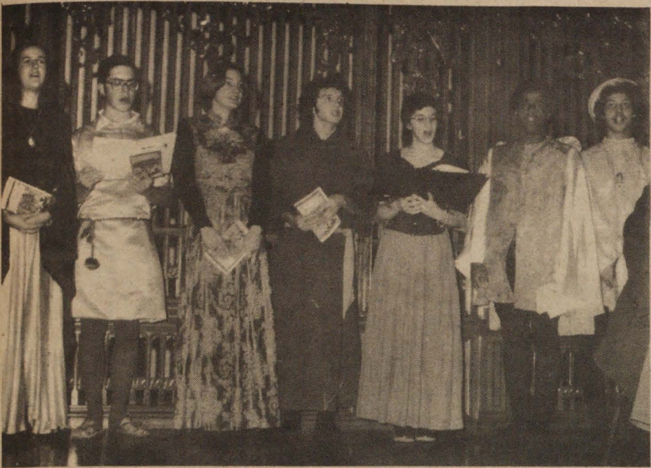
MADRIGALS — performed at Christmas at Allison Dinner