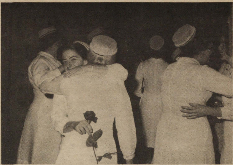
EXPRESSIONS OF JOY — charter nursing class after Pinning Ceremony