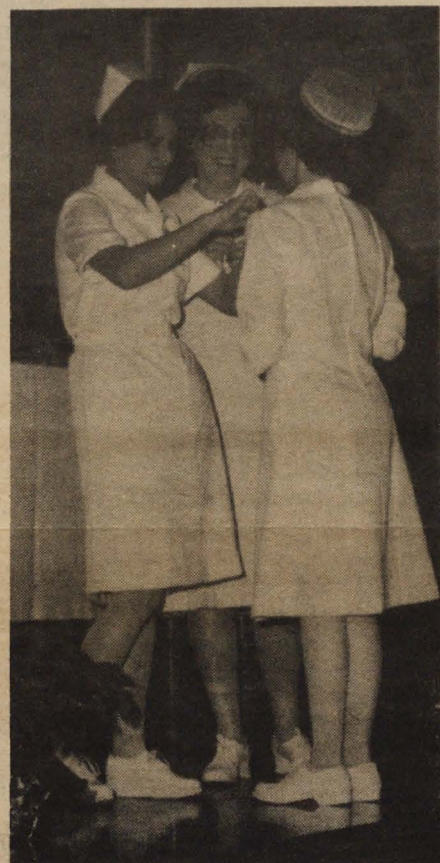
PINNING CEREMONY — held Dec. 18 in college chapel